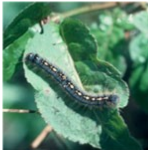
Forest tent caterpillars