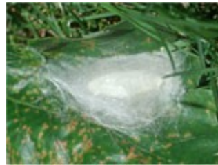
Forest tent caterpillars pupa inside its cocoon