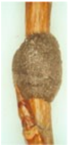
Forest tent caterpillars egg mass on twig